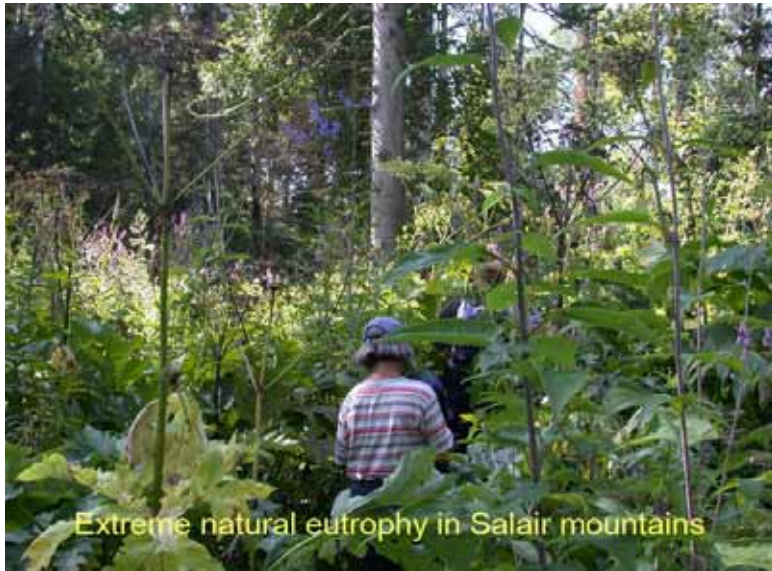
Extreme natural eutrophy in Salair mountains

Each year (July and August), the Weihenstephan University of Applied Sciences in cooperation with the Technical University Berlin offers summer schools in Siberia, supported by the best scientific traditions of Russia and the warm hospitality of the Siberian people. The excellent didactics, high language skills and outstanding professional competence of the scientific guides provide deep insights into the different landscapes, covering all climatic zones from tundra to semi-desert. Well trained staff with over 12 years of experience guarantees the best individual service even under field conditions. Our summer schools comply with international standards in teaching and enable you to make exceptional personal experiences